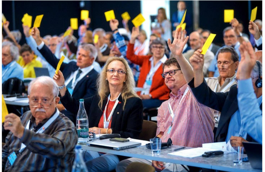
Political signals from Montreux: resolutions of the Council of the Swiss Abroad call on the Federal Council to act.

Finally, the election manifesto approved by the CSA contains further political demands. Besides the core demand to make it easier