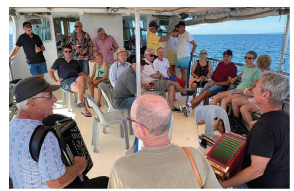
A sing-along on the high seas on the way to Peel Island

Thank you again for your continued support and we look forward to catching up with you at one of our events.