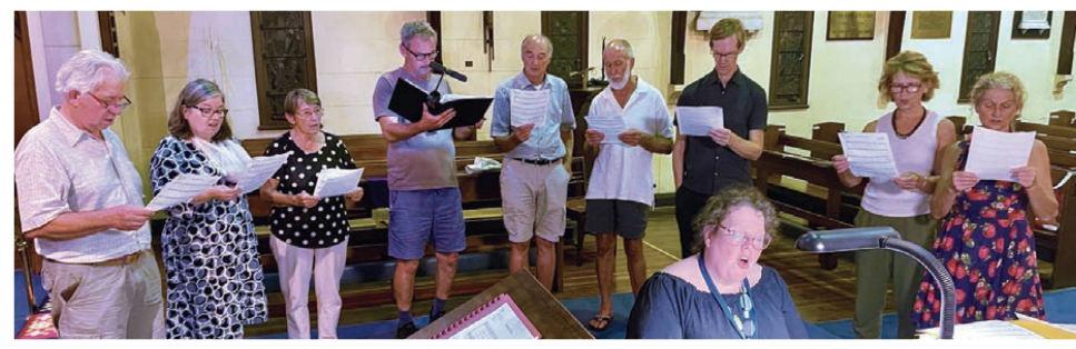
The 'heavenly voices' of the Yodel Choir & Folklore Group 'Baerg-Roeseli

Swiss citizens in our region are reminded that it is mandatory to register with the Swiss Consulate General in Sydney. Please also ensure that the