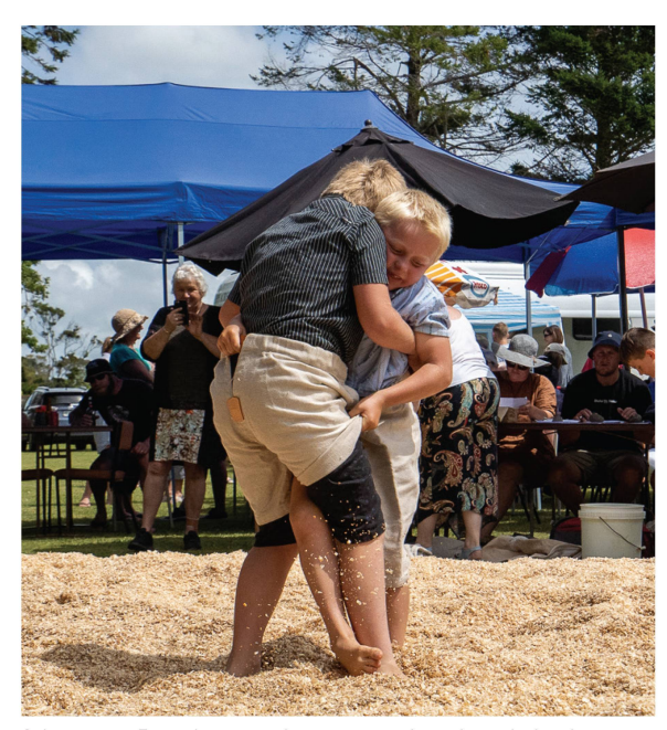
Schwingen in Taranaki – even the young ones know how it's done!

Our fabulous Annual Picnic was held on 14 February (this was very fortunate as the following day our Covid level restrictions went up as well as the weather being atrocious!!) with an excellent crowd. BBQ and children activities were held, but for most the