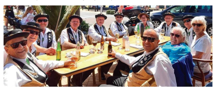
Swiss Kiwi Yodel Group Auckland at the Orewa Boulevard Arts Fiesta