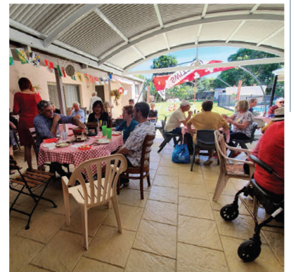
...and the Fraser Coast