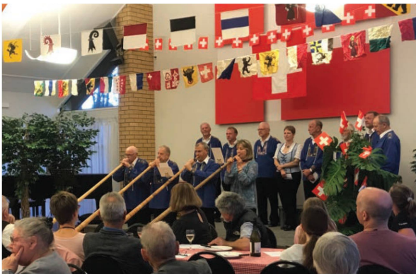
Swiss National Day celebrations in Auckland...