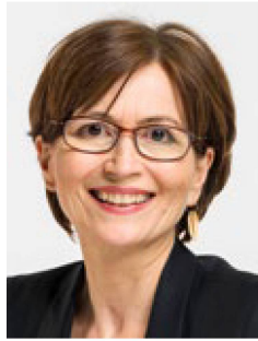
National Councillor Regula Rytz: "An attempt to silence the bearers of bad news."

dictory statements have been unsettling people more than helping them," said Lucerne National Councillor for The Centre, Leo Müller, adding that clear communication and clear rules on what and what not to say were vital in times of crisis.