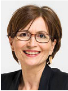
National Councillor Regula Rytz: "An attempt to silence the bearers of bad news."