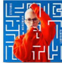
STEFANIE HEINZMANN: "Labyrinth" BMG, 2021

And again, that mischievous smile. That quaint Valais lilt. Stefanie Heinzmann wears her heart on her sleeve. She is a frequent fixture on Swiss television at the moment, starring on reality shows ("Das Schweizer Tauschkonzert", the Swiss version of The Best Singers), advertising health drinks, and plugging her new album.