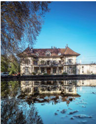
The Eichberg feudal country estate of the noble Bernese von Fischer family

As if preordained by Mother Nature some 14,000 years ago, there is something unique about Uetendorf's geographical whereabouts. When the Aare Glacier slowly receded at the end of the last Ice Age, it left behind a landscape of small hills that today look like natural viewing platforms offering a view over Uetendorf and across the levels of the Aare Valley to Thun. Look