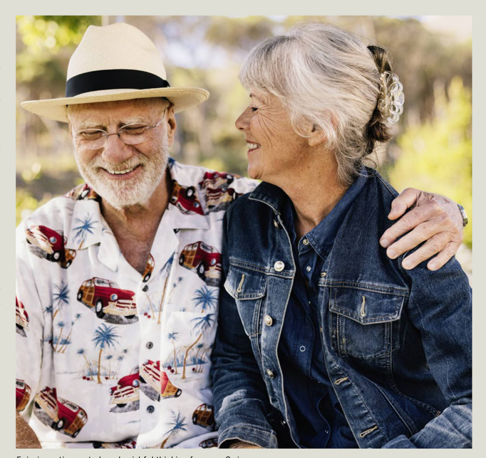
Enjoying retirement abroad: wishful thinking for many Swiss.

Other subjects included general information about finances, retirement homes, pol-