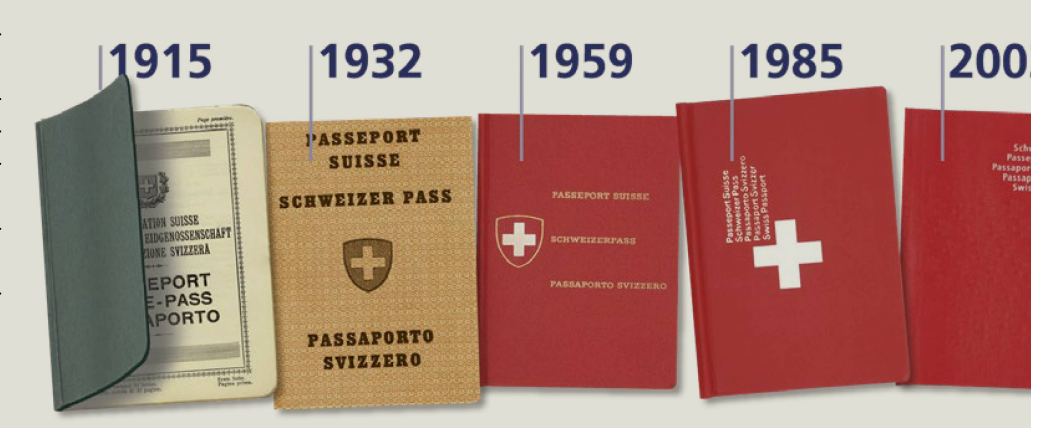
The history of the Swiss passport reflects decades of technological and social progress.