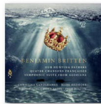
BENJAMIN BRITTEN "Our Hunting Fathers Quatre Chansons françaises", Symphonic Suite from "Gloriana" Prospero Classical 2022

Basel is well known as a city of art. But it is first and foremost a city of music, boasting as many as four different orchestras of international standing. La Cetra specialises in baroque music, and the Basel Sinfonietta in contemporary music. The Basel Chamber Orchestra has a wide-ranging repertoire, while Sinfonieorchester Basel plays opera as well as major symphonies.