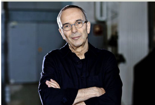
Jossi Wieler, Swiss Grand Award for Theatre/Hans-Reinhart-Ring 2020.