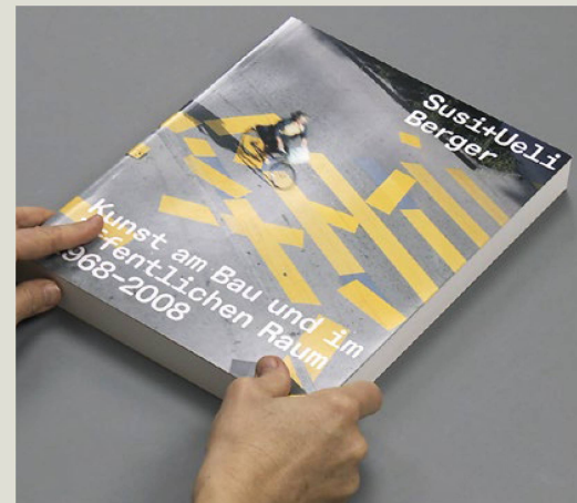
"Art in architecture and public space 1968–2008" by Susi & Ueli Berger – winner of the "Golden Letter" at the 2023 "Best Book Design from all over the World" competition in Leipzig.