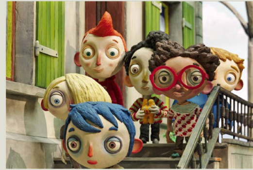
"My Life as a Courgette" won Best Fiction Film at the 2017 Swiss Film Awards and was nominated as best animation at the Oscars.

Through involvement in events, projects and translation work, the Swiss arts council Pro Helvetia helps to showcase Swiss cultural practitioners abroad. This includes funding public presentations, organising promotional events for international hosts, appearing at international exhibitions and networking events (e.g. Venice Biennale and Avignon Theatre Festival), and producing promotional material. The six Pro Helvetia liaison bases in Cairo, Johannesburg, Moscow, New Delhi, Shanghai and South America foster relations with local partners and cultural institutions, act as intermediaries on the ground, and offer residential, research and exchange programmes that allow artists and cultural practitioners from Switzerland to gain a foothold and engage with international audiences.