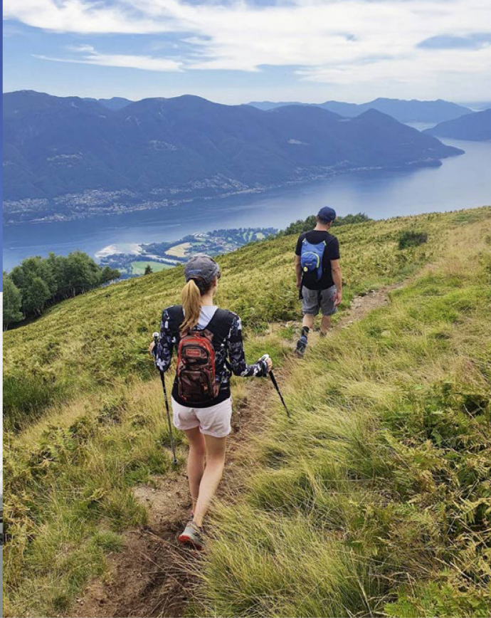
From ski resort to hiking destination – nearly all the ski lifts at Cardada-Cimetta have been dismantled.

Switzerland has around 260 automatic monitoring stations like the one at Locarno-Monti. This ground-based network goes by the name of SwissMetNet.