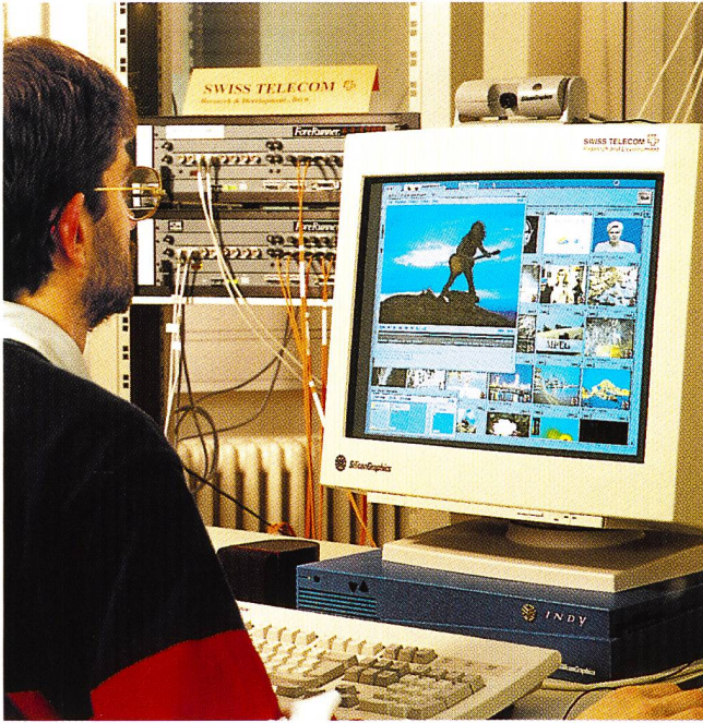
Figure 3. Video retrieval application running over ATM.