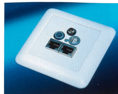
Die Multimediadose von R&M

Die Arbeit des Planers wird vereinfacht. Aufwändige Abklärungen entfallen.