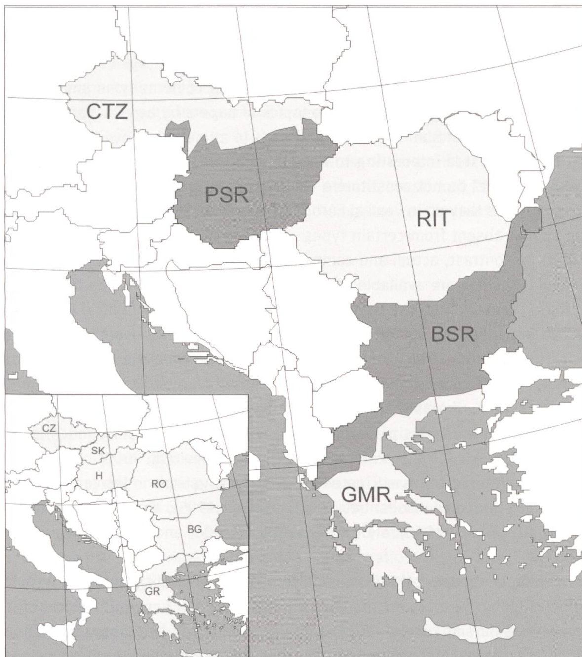
Map 1. Transect divided into natural territories according to the distribution patterns of wolf spiders (abbreviations in main text). Inset: Countries lying on the selected transect.

on material readily collected in pitfall traps (e.g. Tretzel 1952). In 1970–1982, 41.8% of all spider species collected in Bohemia by applying this collecting method were species of the family Lycosidae (Buchar 1995). The easy way of collecting lycosid spiders, however, did not invariably result in unequivocal development of knowledge. Often there arose numerous synonyms as well as homonyms. As late as in the second half of the 20 th century, there appeared modern manuals permitting an integral species identification. They pertained, e.g., to the genera Arctosa (Lugetti & Tongiorgi 1965, 1966), Alopecosa (Lugetti & Tongiorgi 1969), Pardosa (Tongiorgi 1966a,b, Holm & Kronstedt 1970), and Trochosa (Engelhardt 1964). Subsequent papers differentiated hitherto