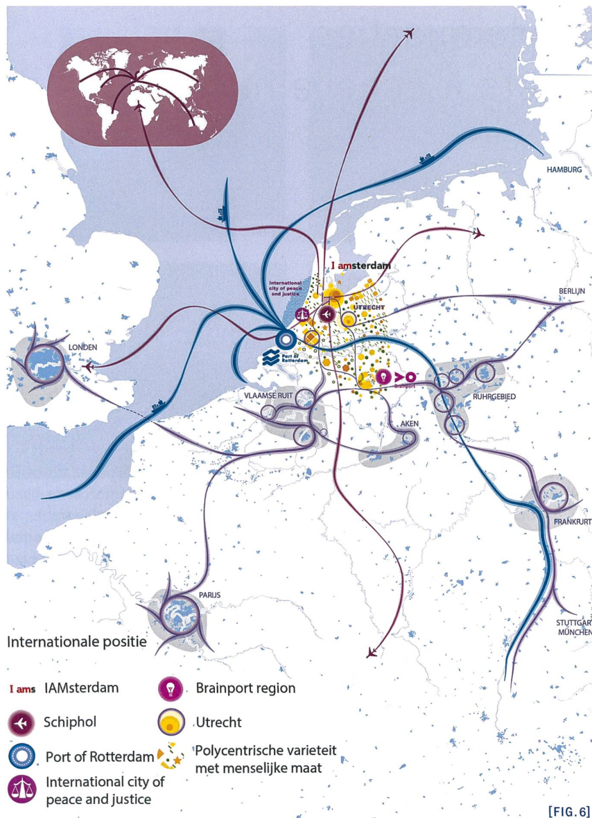
[FIG. 6] Visualisation of the international position and perspective of the Spatial-Economical Development Strategy of Amsterdam, The Hague, Rotterdam Utrecht and Eindhoven.