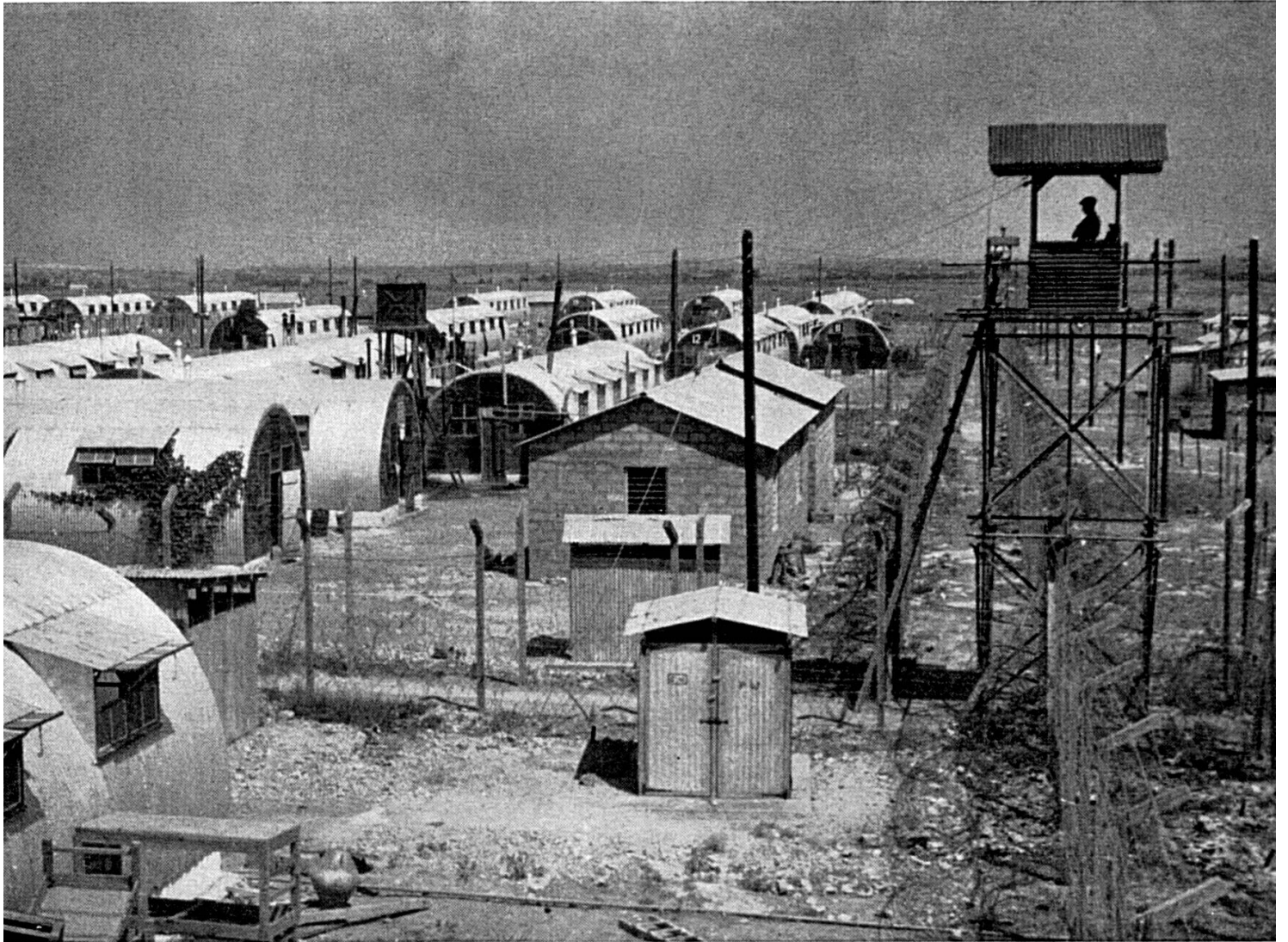
The General-Delegate of the ICRC for the Near East made three visits to Pyla Camp, the largest place of detention in Cyprus