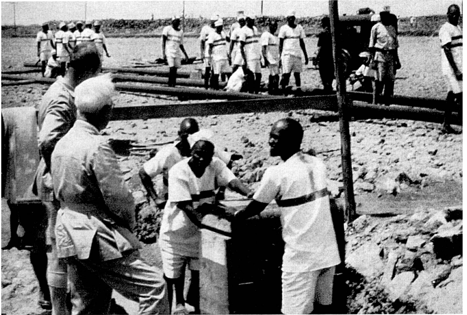
In a working camp in Kenya the delegates of the ICRC converse without witnesses with the detainees