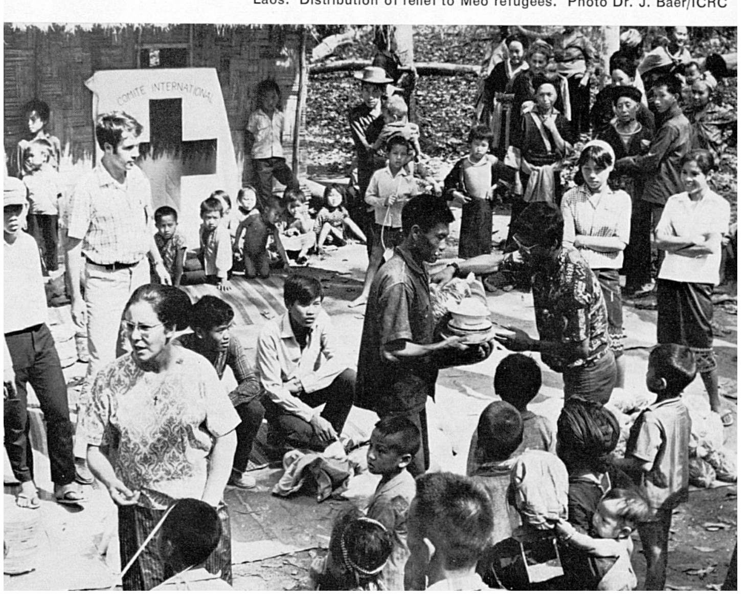
Laos. Distribution of relief to Meo refugees.