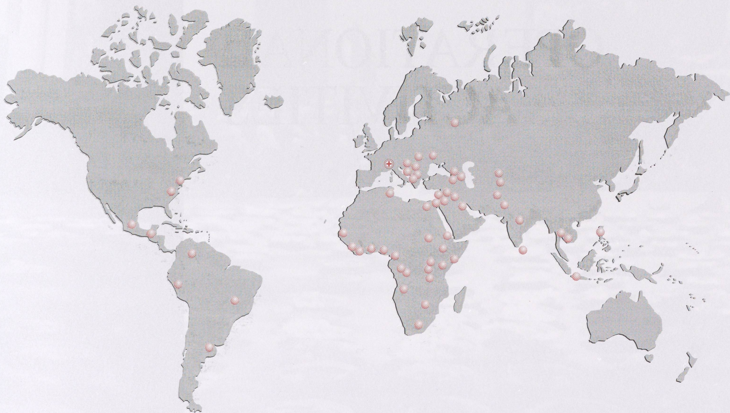
The ICRC around the world in 1998