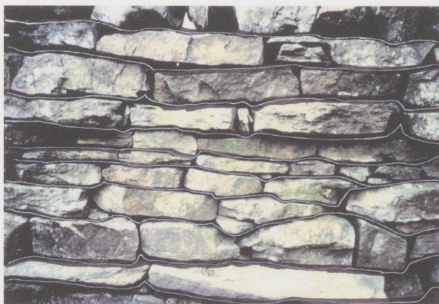
DRY STONE II: «Wall» is constructed from bottom up. Each stone represents a solo. Conductor indicates each soloist, and then brings her in. When the next soloist enters, the previous soloist must freeze the last fraction of whatever she is playing and loop it, continuing the loop throughout the first three «lines» of stones while making a slow decrescendo. This process occurs three times, with the conductor indicating each time the process starts again.

about trying to do the right thing at the right time. At this point I might also introduce some of my graphic scores (which are partly reproduced in this article), particularly the ones that deal with memory and repetition like Screen and Dry Stone .