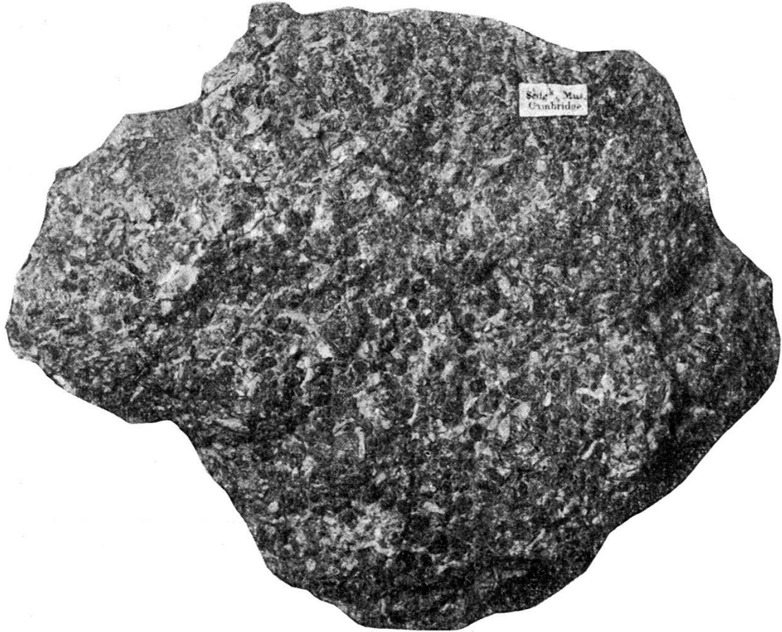
Fig. 1. Hand specimen of Atascadero Limestone in the Sedgwick Museum, Cambridge, England. (Natural size.)

of two irregular, hand specimens. One is broken out of the solid limestone and the other, (Fig. 1) a slightly larger piece with a weathered surface covered with orbitoidal foraminifera. The material I collected consists of several pieces of partially weathered material and about a pound of well weathered material from which I took the forms herein described.