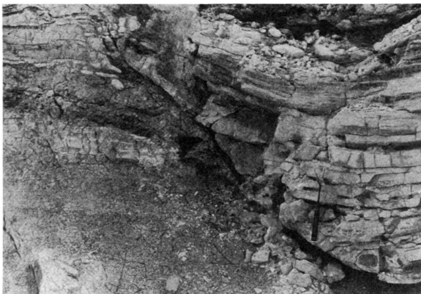
Fig. 63. Detail of the Toledo channel and the Urría filling as shown in fig. 62.

None of these units is lithologically reminiscent of the Urría beds which therefore are tentatively regarded as relics of a formation laid down during one of the gaps in above succession. Radiolaria are common in the Lower to Middle