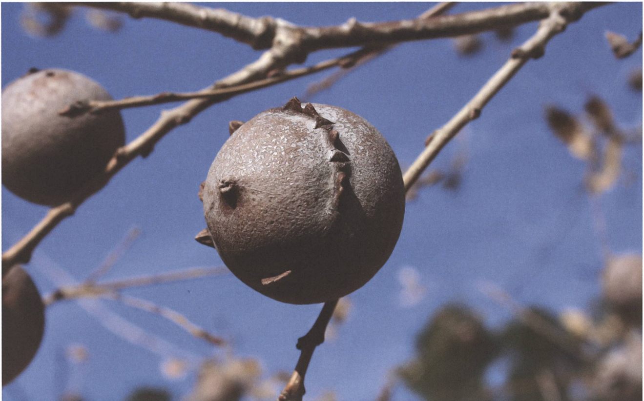
3 Tannin-rich galls on an Aleppo oak branch in winter, the preferred raw material for pigment in medieval ink-making.