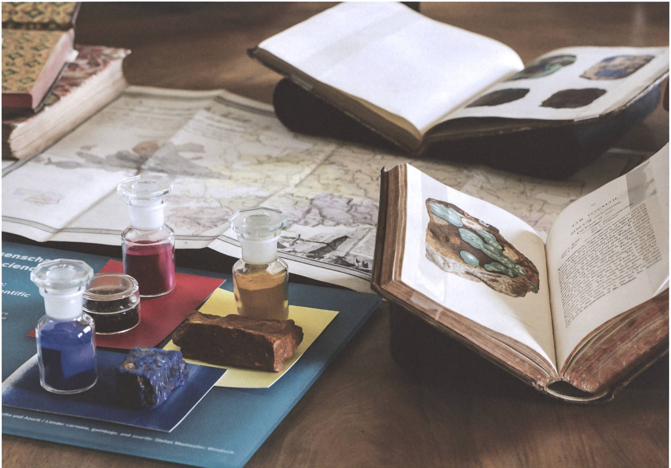
1 Pigments and their raw materials on display in the Ernst Müller Zimmer, home to the majority of the Iron Library's old and rare books collection.

Dutch, and “bog” in Danish derive from the Norse “bok” or proto-Germanic “bokiz,” meaning “beech,” which was the wood most commonly used to make writing tablets. 4 This is similar to the root of “codex,” Latin “caudex,” which originally meant a “wood balk” or “log.” 5 The French “livre,” Portuguese “livro,” Spanish and Italian “libro,” even the Gaelic “leabhar” and Welsh “llyfr” all stem from the Latin “librum,” which itself derives from the proto-Italic word used to denote the inner bark of trees such as birch. 6 These natural sheets have long been used as media for carrying writing. 7 Meanwhile, “Bible” derives from the Greek “biblion,” a word that had come to mean a piece of writing but also meant “papyrus scroll,” a name taken from the port of Byblos, which was the primary exporter of Egyptian papyrus in the ancient world. 8