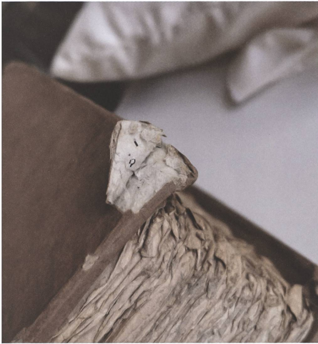
5 Damage to the corner of a cheap nineteenth-century card transport binding, revealing the recycling of old sheets of paper.