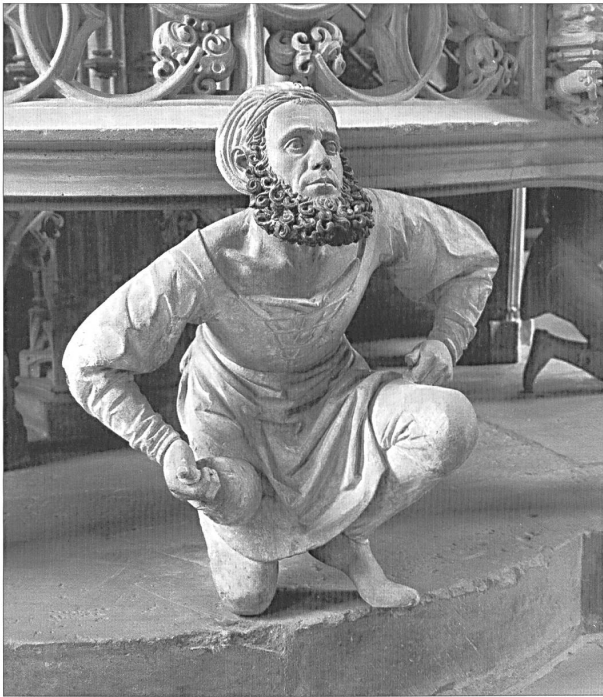
Fig. 4: Adam Kraft, Self-Portrait at base of Eucharistic Tabernacle, St. Lorenz, Nuremberg.