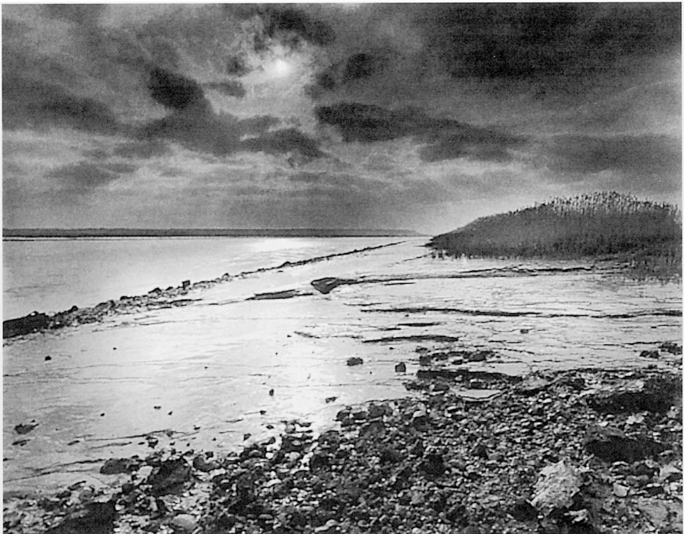
Fig. 1: L'estuaire de la Seine (France) Seine Estuary (France) Seinemündung (Frankreich)

The expert's role in this process is to bring coherence to the resource-population-environment-development nexus. Taking an actual management situation as a starting point, he or she is supposed to assist the community in