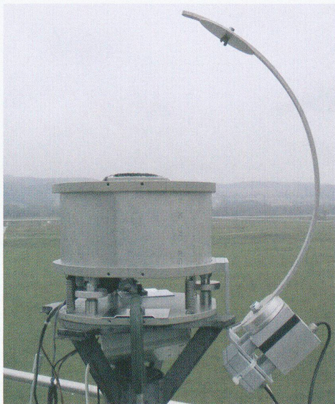
Fig. 3: Camera system Kamerasystem Système de caméra