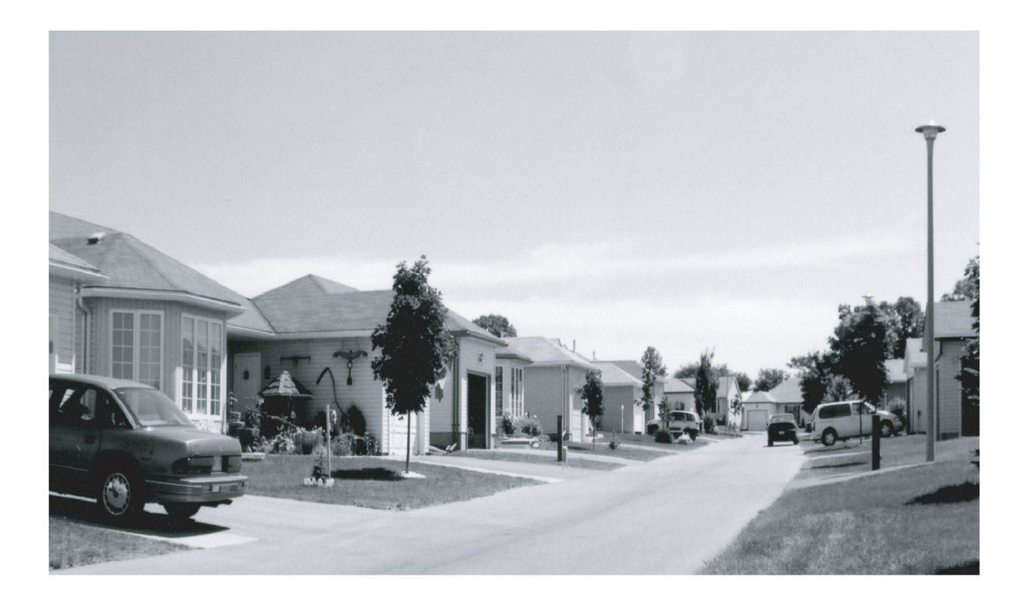
Fig. 3: Examples of the housing typically available in for-profit communities Typische kommerzielle Rentnersiedlung Exemples de logements disponibles dans les communautés à but lucratif

tems designed to summon help, wheelchair accessible bathrooms and the provision of secure nursing facilities are included in this category. If the impression created by the sentence is unclear or irrelevant the sentence is classified in a final category: ambiguous.