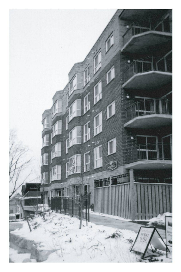
Fig. 2: An example of a non-profit retirement community

Retirement villages offer residents a wide range of recreational facilities, whereas the assortment of recreational amenities provided by retirement subdivisions is often restricted to a clubhouse (HUNT et al. 1983). Housing options are greatest in retirement villages and may include both owned and rented dwellings, single-family homes and apartments; they are considerably more limited in subdivisions where it is usual to find only one type of dwelling. Support or medical services are not usually provided in either retirement villages or subdivisions. Continuing care communities are defined as facilities that are designed to provide different levels of care and support in one location. Care options available range from help with housekeeping and medication administration to complete