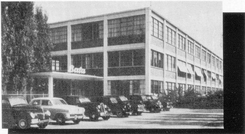
The Bata factory in Möhlin as it existed in 1960. Today, sadly, the manufacturing of shoes at this plant is at a standstill.

Switzerland's best known shoes have actually a foreign origin. Thomas BATA, born in 1876, was a Czech. He was not only the first to produce shoes by machines, but he also built next to his factories whole housing estates for his workers, complete with gardens, parks and shops. One of these typical housing estates still exists in Möhlin (Aargau).