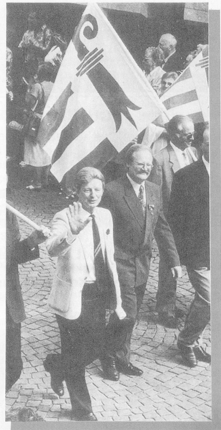
Roland Béguelin (centre) marching in one of the many demonstrations that took place for years in the Jura.

In order to make counterfeiting more difficult, new five franc coins may be produced in 2 or even 3 colours. This was announced recently by the Federal Councillor Otto Stich (now Bundespräsident) when he opened the new Federal Mint in Berne. To obtain multi-coloured coins, different metal amalgams are being used, one for the central part of the coin and one or two others as outer ring or rings.