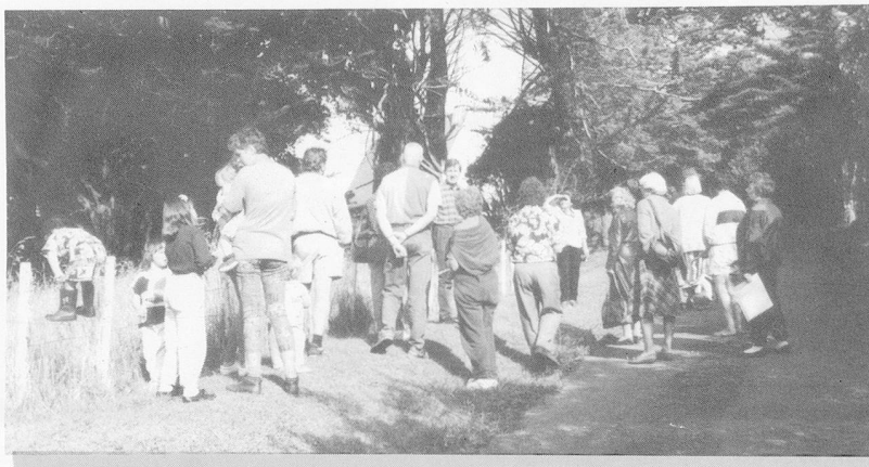
The Bicultural Day participants on the site of the famous pa called Mataitaua. The St Albans Church in the background was consecrated in 1898.