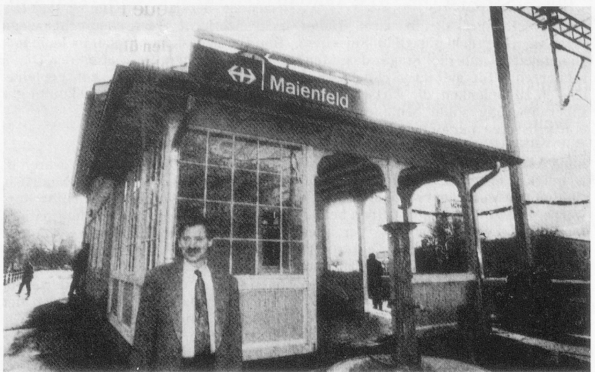
The Maienfeld railway station with its own, private station master who no longer works for the SBB but only for himself. He no longer wears the SBB regulation uniform either.

The SBB/CFF expect to turn over 250 small railway stations which are no longer commercially viable into "ghost stations". With no staff and no station master and only machines to sell tickets, these railway stations are electronically controlled by nearby major railway centres and therefore have become "ghost stations". But private enterprise and enthusiasm has resulted in some stations being taken over by individuals who run them at their own expense, collecting commissions from ticket sales. Tecknau in Basel, Nottwil in Lucerne, Bruggen in St Gallen and now Maienfeld in Graubünden are typical examples of stations saved from this modern trend of becoming "ghost stations". The case of Maienfeld is unique inasmuch as it has been taken over by the Railways Union itself, the first time the union has done so since its foundation 75 years ago.