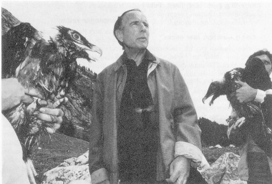
Prince Sadruddin Aga Khan releasing two vultures in the Alps.

Alp Action is the brainchild of Prince Sadruddin Aga Khan. Prince Sadruddin lists the main challenges facing the Alps: "Alarming decline in animal and plant habitats and bio-diversity, air quality, natural water supply and the loss of mountain agriculture. Already 100 million tourists and 73 million tonnes of goods transit yearly by road through the Alps and that figure is anticipated to double by the year 2010".