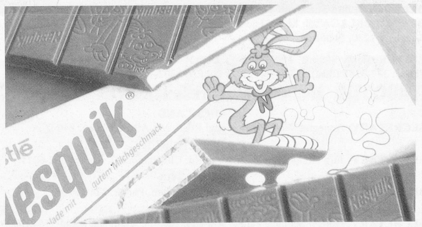
Happy chocolate bunny bar.

The Nesquik bunny will feature in all media campaigns, whether newspapers, TV, comic strips or cartoons. In Germany for example, he is the star of a video game designed to develop concentration and quick reactions. In Belgium, he sponsors the Antwerp zoo and in Korea, the bunny gives a welcome boost to road safety and environmental protection.