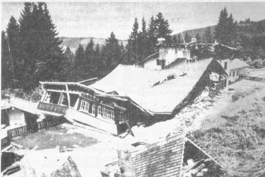
Same place 24 hours later.

Today 36 chalets, the hotel, 2 alpine huts and a holiday home have been destroyed. Since July 1994 the area has been completely sealed off. Despite the dry summer, the land keeps on sliding down and experts fear now that the whole slope will slide down into the valley below where it could block the river and flood the whole area.