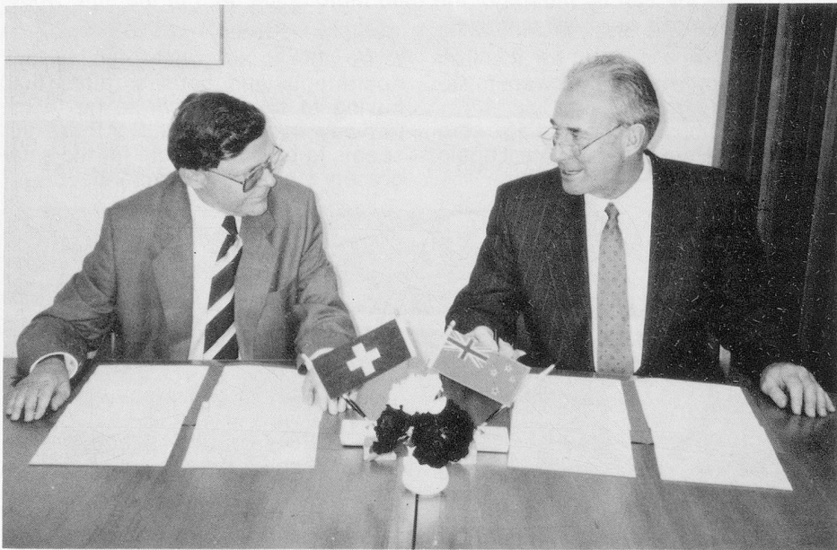
Mr. Thurnheer and Mr. McKinnon having a little chat just before signing the joint statement.

"I am pleased to see New Zealand develop its international Antarctic science links" Mr. McKinnon continued. "It is important that Antarctic Treaty nations commit themselves to programmes of international cooperation in Antarctica. This is a central element of the Environmental Protocol to the Antarctic Treaty which New Zealand recently ratified", Mr. McKinnon concluded.