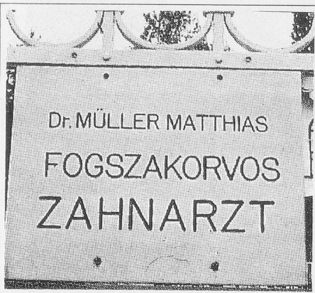
A familiar looking name for a "Hungarian" dentist. Whatever his nationality, his services are much cheaper than in Switzerland.