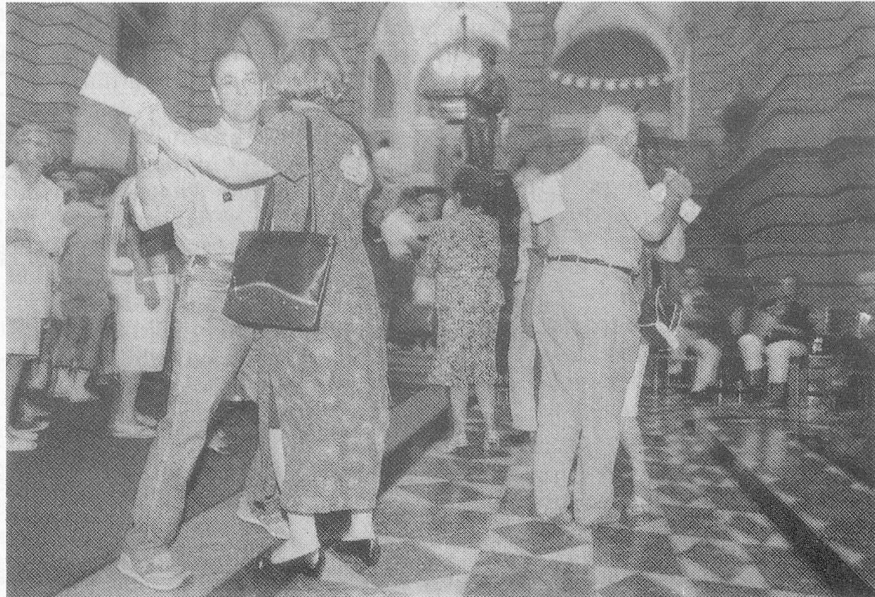
The marble floor of the Federal Palace lobby was a perfect place to dance to some real Swiss music.

A particularly popular attraction was a stand where you could test your skill with a real "Armbrust". Three shots for 3 SFR. All participants who reached a minimum of 34 points were given a signed souvenir photograph of their favourite Federal Councillor. However, to obtain a photo of the "Bundespräsident", Kaspar Villiger, a minimum of 36 points was required.