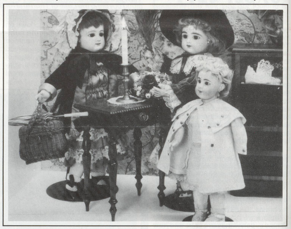
Part of the artful display of dolls in Stein am Rhein's unique dolls museum.