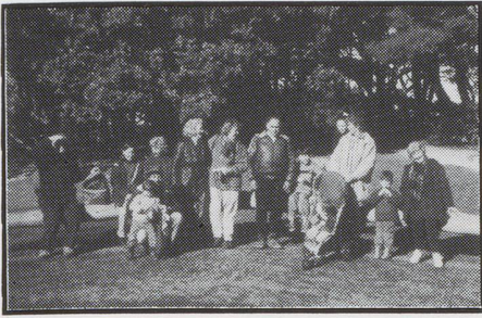
Having a rest during our Northern walk.