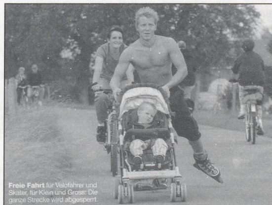
Freie Fahrt für Velofahrer und Skater, für Klein und Gross: Die ganze Strecke wird abgesperrt.

On Saturday June 8 there will be a 'roller-parade' in Neuenburg along the lake of Neuenburg, with inline-skates, kickboards and scooters ('Trottinetts' as the Swiss call them). Let's hope the weather is fine for the weekend! Ed.