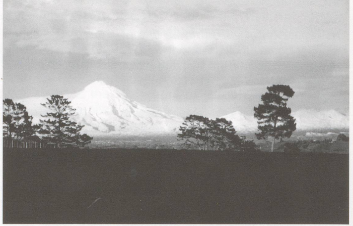
Maybe Mt Taranaki/Egmont will be looking like this over Christmas and then we'll have our own little piece of Switzerland right here.