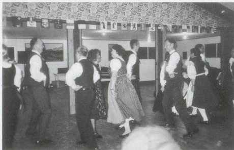
Members of the trachtentanz group in action.

brought back memories of dances that we once did! They all wore traditional costumes from their various regions, which were very colourful. They sang beautiful songs under the guidance of a very talented lady. The highlight of the entertainment for many was when the group asked the children to join them in performing a simple dance ... which the children did with great enthusiasm and they were determined to accomplish the dances in style ... well done to all the children who participated ... you did very well! If only we had someone in Taranaki capable of teaching trachtentanz, we would have many keen children ready to give it a go.