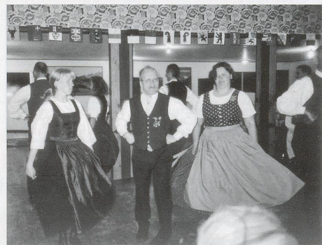
Some of the lovely costumes worn by ETUI members.