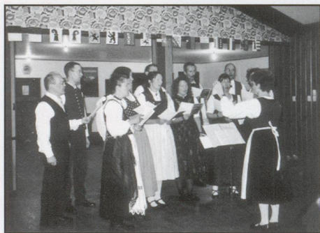
The ETUI singers performing a lovely number.

On October 31 we hosted a group from ETUI (European Tanz Union) who boasted members from Germany (the main contingent in the group), Austria and Switzerland. They were touring New Zealand and wanted to perform at different venues, so they showed their talents at the Wellington and Taranaki Swiss Clubs, and were hosted by the Bohemian Society in Auckland and Hamilton. They presented items of dancing (trachtentanz) from various European countries, singing and music. Some of the trachtentanz performed