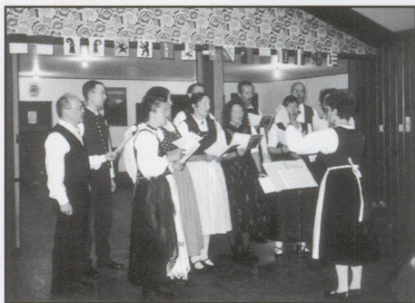
The ETUI singers performing a lovely number.

On October 31 we hosted a group from ETUI (European Tanz Union) who boasted members from Germany (the main contingent in the group), Austria and Switzerland. They were touring New Zealand and wanted to perform at different venues, so they showed their talents at the Wellington and Taranaki Swiss Clubs, and were hosted by the Bohemian Society in Auckland and Hamilton. They presented items of dancing (trachtentanz) from various European countries, singing and music. Some of the trachtentanz performed