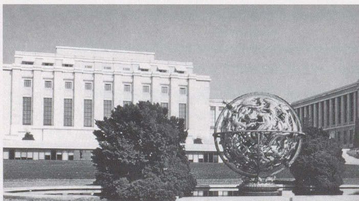
United Nations Building

The Palais des Nations (United Nations) has a total of some thirty conference rooms and 1100 office rooms, its own printing office with many photocopiers and offset machines, restaurant, a snack bar and a number of refreshment bars. The interior is comfortable and equipped with the most modern technical services. The large assembly halls have simultaneous interpretation facilities, enabling speeches to be translated into and out of the five official languages of the United Nations (English, French, Spanish, Russian and Chinese).