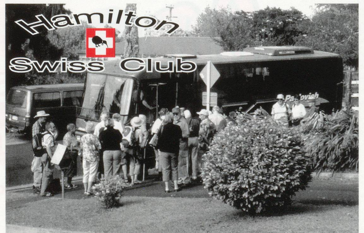
Hamilton Club: Swiss Farmers saying goodbye to their host families.