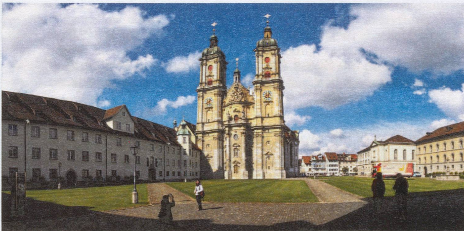
The present cathedral of St. Gallen was built in the 18th century

festival originated in old school customs celebrated on St. Gregory's Day, in memory of Pope Gregory I.