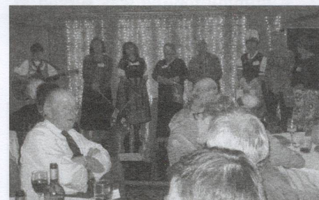
Women singers entertained us all beautifully at the Sorrento wit their potpourri