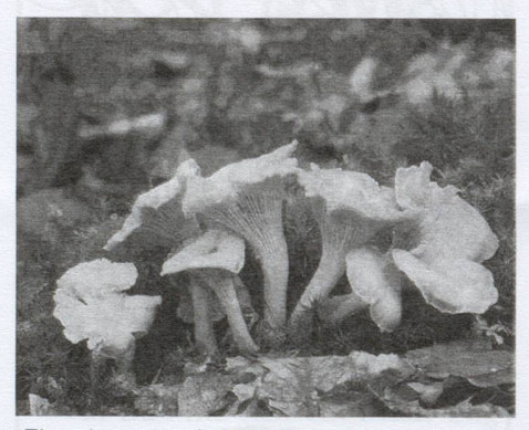
Eierschwämme (cantharellus cibarius)

ski touring season throughout spring just to have an idea when the mushrooms might begin to grow. Most people believe mushrooms only grow in autumn, and therefore forests and alpine meadows are left pretty much alone at the beginning of the summer. By then the shepherds have moved up their stock to the