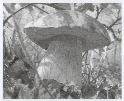
Steinpilz (boletus edulis)

The first basket full of mushrooms in the season is always something special for me. Every year I'm longing for the beginning of the mushroom season. I always watch the weather conditions, right from the end of the