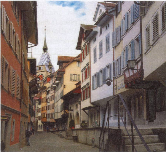
Zug's Old City with Zyturm

move towards trade and industry. The canton is now the richest in Switzerland.