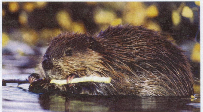
Holding a twig in its claws, a beaver gnaws the bark with its sharp teeth

Pro Natura wants to work with riverside power stations to open the so-called "beaver barriers" that such utilities often build. It seeks cooperation with cantonal authorities and communities to ensure that