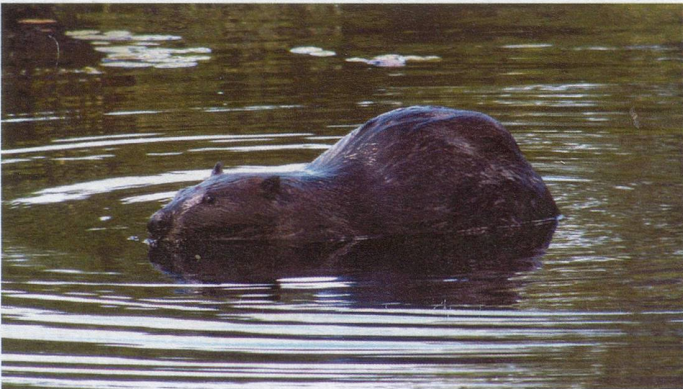
A beaver sunning itself

There are an estimated 900 beavers in Switzerland. Pro Natura, the country's leading conservation agency with an annual turnover of SFr 12 million, says beavers should once again feel at home in Switzerland, and wants to expand beaver-friendly habitats.