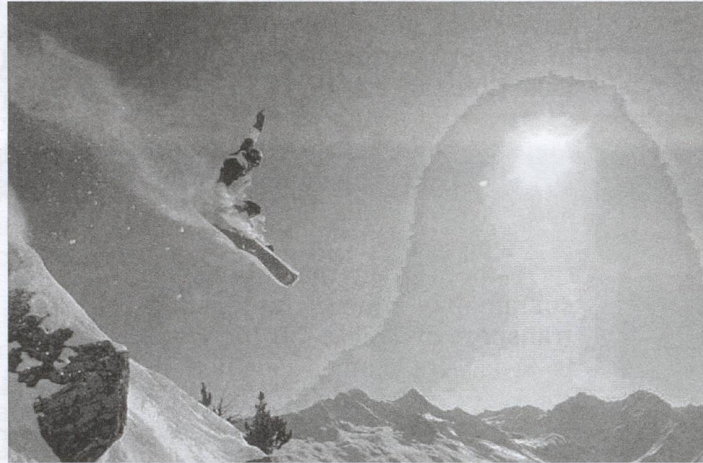
Alpine freeriding near Davos

I try to remain true to myself. It's a sport for individualists. The aim of the game is to leave your mark in the snow. I don't want to be on top of a mountain with 15 other people.