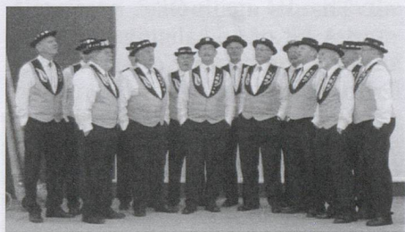
Our great Yodlers